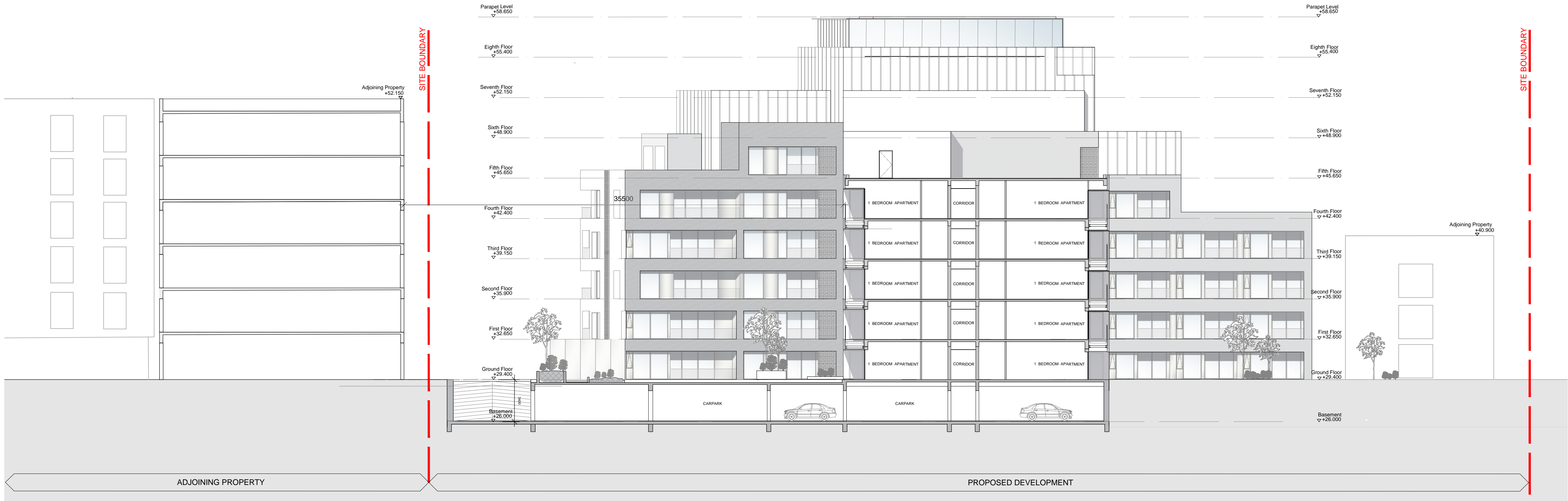
Section D-D - Scale 1:200@A1